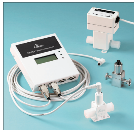
Figure 1. Entegris IoR Concentration Monitors

The process of removing cells and cellular debris from a harvested culture prior to purification is typically performed using depth filtration, tangential flow filtration, centrifugation, or a combination of methods. Filters are often placed downstream in order to capture any material that escapes the separation method. PAT methods are